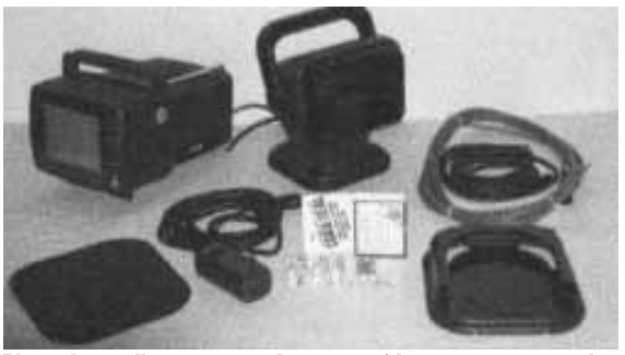
Photo shows all components that come with new remote-control camera..

Contact: FARM SHOW Followup, Lyle Honess, RR 1, Evansville, Ontario, Canada P0P 1E0 (ph 705 282-2501).