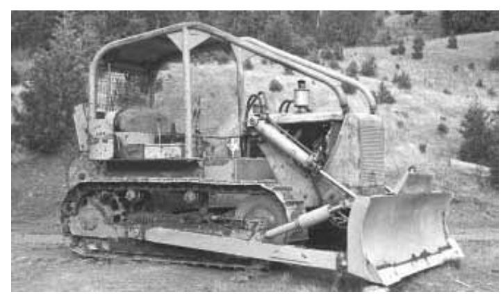
A Ford transmission mounts in front of the Cat's original 5-speed transmission and drives it via a short drive shaft equipped with a slip yoke.

Contact: FARM SHOW Followup, ERC Communications, 313 N C Street, Box 427, Edgar, Neb. 68935 (ph 402 224-8125; fax 4300)