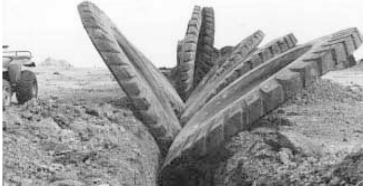
A view of tires in ditch before back filling makes them stand up.

Contact: FARM SHOW Followup, Roger Wenzel, 40425 252nd St., Mitchell, S. Dak. 57301 (ph 800 657-8085 or 605 996-5423).