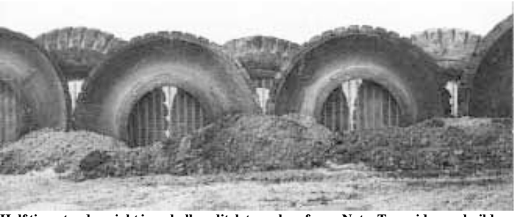
Half tires stand upright in a shallow ditch to make a fence. Note: To avoid snow buildup, the Wenzels no longer put plastic barrier between tires as shown in photo.