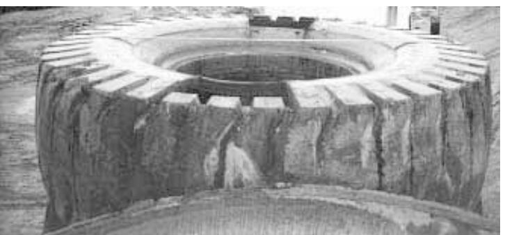
This innovative waterer freezes up less quickly than conventional waterers made from tires. Access holes are cut in sidewalls rather than removing the entire tire sidewall, as is usually done.