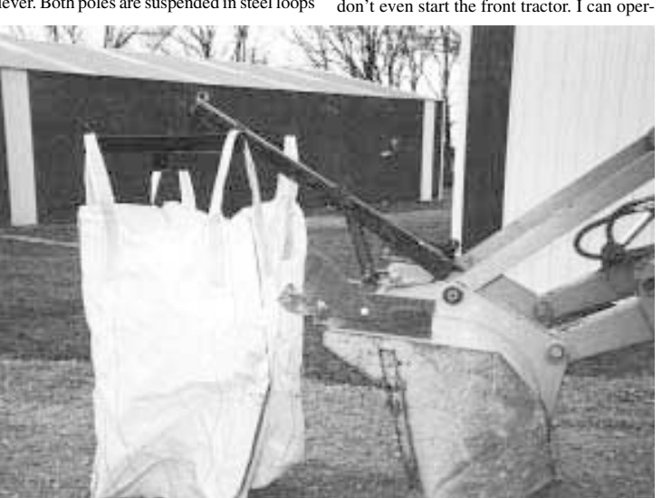
Seed handler mounts on bucket of Coles' Case 580B loader tractor.

"I use it to do most of my tillage work," says Blomenberg, who farms 140 acres. "I use it to pull an 8 1/2-ft. wide chisel plow, 3bottom Deere moldboard plow, and a land leveling system that consists of a 9-ft. wide blade and a 9-ft. wide culti-mulcher and heavy-duty harrow combination. It makes a nice seedbed. I mounted dual wheels on the rear tractor because the wheels on the chisel plow followed directly in the tractor wheel marks, making the chisel plow not level. When I don't have to pull much of a load I don't even start the front tractor. I can oper-