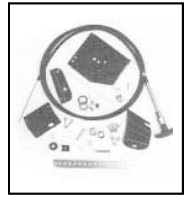
Cable-actuated kit replaces GM's original 4-WD shifter.

Sells for $149.20 for full-size pickups; $84.95 for S-10's.