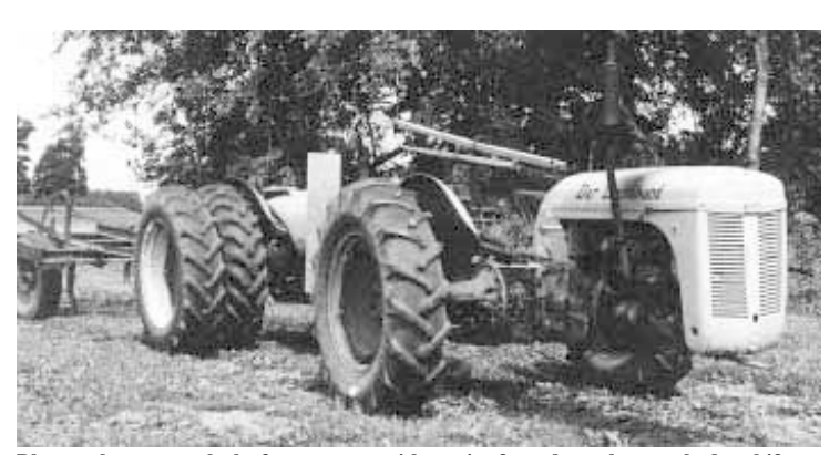
Bloomenberg controls the front tractor with a pair of wooden poles attached to shifters.