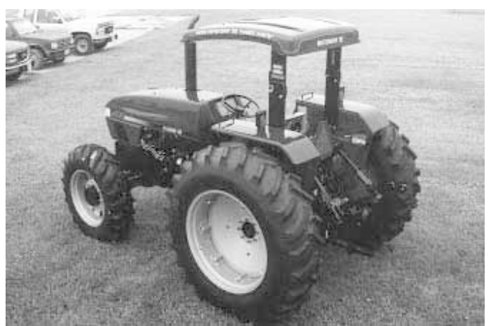
Canopy is made from a ceramic material that reflects heat better than fiberglass.