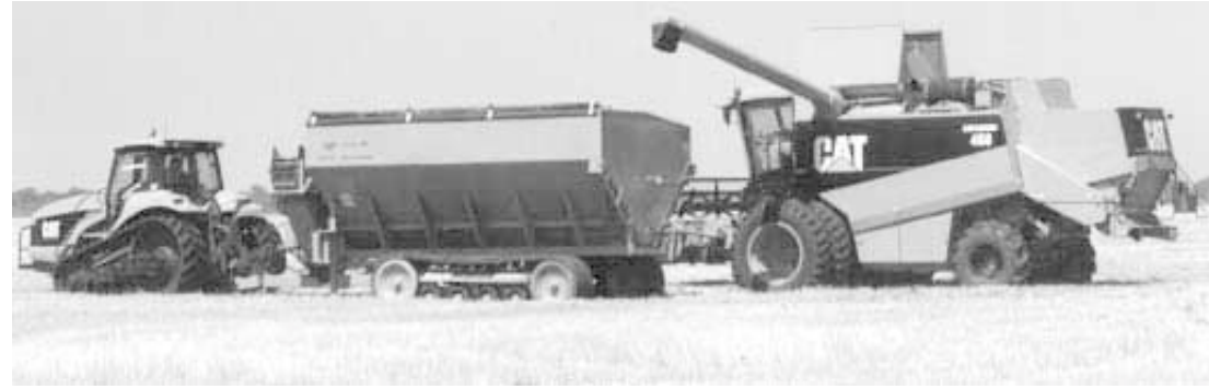
New 1,000-bu. grain cart mounts on Caterpillar rubber tracks and is designed so that the Cat VFS 70 track system can be removed by pulling two pins and jacking up the wagon. Tracks can then be used on other equipment.

"The ability to quickly mount many kinds of equipment on the cart frame makes your investment in the VFS 70 track undercarriage much more worthwhile," says Tolbert. "We tested the cart for the first time this year on wheat and found that it can unload more than 200 bu. per minute. We plan to test it this fall on corn and soybeans. The cart is designed