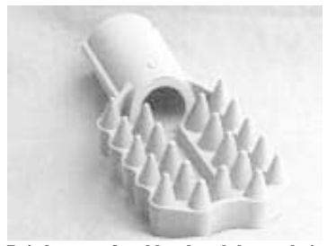
Bristles on soft rubber brush loosen hair so that it can be vacuumed away.

Sells for $19.95; adaptor sells for $4.95 plus S&H.