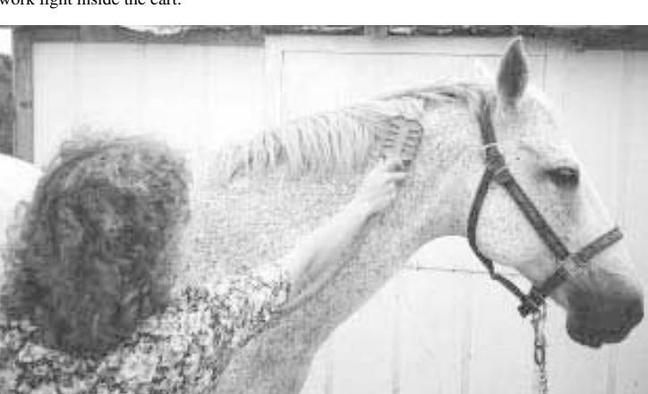
Brush fits on end of vacuum cleaner hose to suck hair off as it brushes. By using an adapter you can attach it to a garden hose and use it to massage and rinse horses.