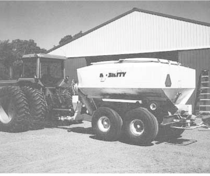
Janikula used a Mobility spinner spreader he bought for $2,300. Once converted to a soybean seeder, it spreads seed in a 45 to 50-ft. pattern.

Contact: FARM SHOW Followup, Unity Seeds, 803 N. 3rd., P.O. Box 344, Kentland, Ind. 47951-0344 (ph 800 338-4558 or 219 474-5810).