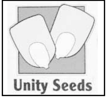
Unity Seeds says making its hybrids available through SAM'S Clubs is a "win-win" situation for farmers since seed costs about half the price of competitors.

For example, in 1996, Unity Seeds yielded 114 bushels per acre on dryland corn, compared with 95 and 99 bushels per acre for comparable Pioneer numbers and 79 and 96