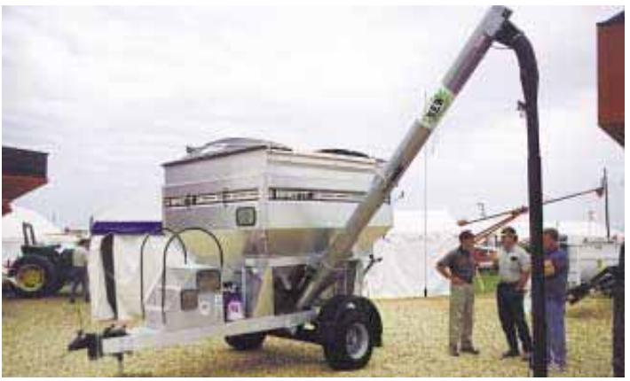
The 150-bu. "Yield Cart" has an all-aluminum frame and box that reduces weight by nearly one third and requires much less maintenance, says the company.

The double-fold auger tucks away to the side and rear of the hopper for ease of transport and compact storage. Other features include a lockable built-in toolbox and optional side extensions which increase capacity to