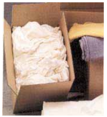
Cloth dairy towels do a better job than paper of cleaning and drying the udder, says the manufacturer.

Sani-Sure dairy towels are made of top quality turkish towel material. They are washcloth size with machined hems. Made in the U.S., standard and recycled towels are