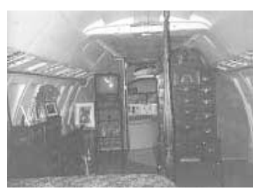
The master bedroom. Note the master bath in the background. It's located in what used to be the cockpit.