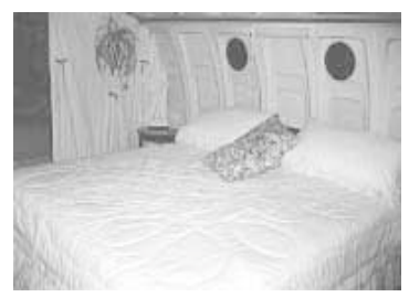
One of the three bedrooms in the plane. Two are furnished with king size beds and the third is furnished with a queen size bed. All three have dressers.