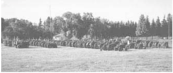
Wythe's collection includes 71 of the 77 McCormick-Deering models built by IH.