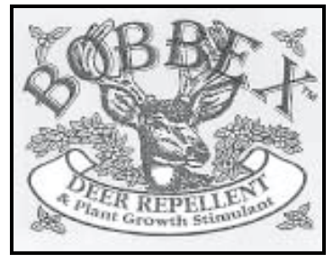
Made from beef by-products, Bobbex deer repellent can be sprayed on any garden or orchard crop.