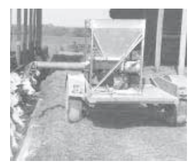
Trailer-mounted metal bin is equipped with a horizontal unloading auger. Scripter pulls the trailer behind his Yamaha 4-wheeler ATV.

Power to run the motor comes from a 12volt battery that Scripter mounted on the trailer. He starts the motor with a pushbutton switch on a cord that he holds in his