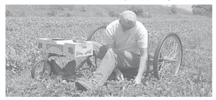
Sit-down cart is designed for use in vegetable and strawberry fields.

Contact FARM SHOW Followup, Beamish Seed Farms, Box 67, Jarvie, Alberta, Canada, TOG 1H0 (ph 780 954-2166; fax 780 954-2671).