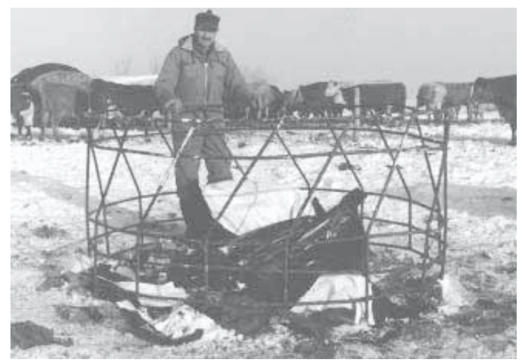
An old round bale feeder such as the one above can be used as a cage to collect and later burn plastic silage bags.

Contact: FARM SHOW Followup, Demco Mfg. Co., Box 189, 4010 320<sup>th</sup> St., Boyden, Iowa 51234 (ph 800 543-3626 or 712 725-2311; fax 2380; Website: www.demcoproducts.com).