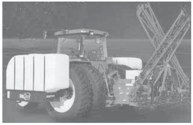
Demco's high capacity saddle tanks mount on extended rear axle spindles that shift weight to the rear, relieving stress on the tractor's front axle and chassis.