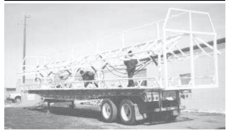
New "double decker" hay hauler is designed to fit any 45-ft. long semi trailer and consists of two cradles. Top cradle is hydraulically tilted down for loading.