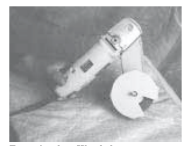
Extension lets Wambeke rotate cutter head back as far as his hands.

"The 10-in. long arm can also be used for mounting a drill," suggests Wambeke. "Simply remove the end cover head shield, take off the nut that holds the cutting wheel shaft, and slide it out. The shaft is then replaced with a chuck and tightened down."