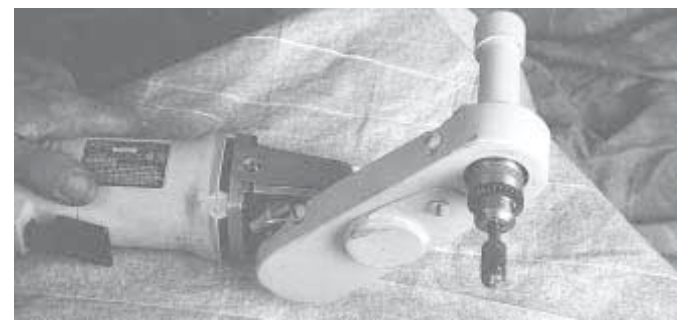
Belt-driven extension for chop saw can also be used to power a drill chuck.

For more information, contact: FARM SHOW Followup, Mitch Vanness, Vanness Repair, 1724 Finch Avenue, Latimer, Iowa 50452 (ph 641 579-6127; E-mail: mdvanness@fiai.net).