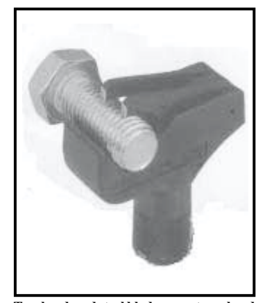
Two hardened steel blade on restorer head are guided by undamaged thread to regroove damaged areas.

Clogged internal threads can be just as frustrating as damaged external threads. The Internal Thread Cleaner, also offered by