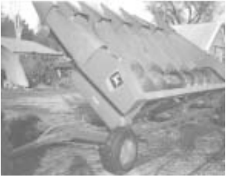
The 4-wheel trailer consists of a cradle that bolts to header and is then tipped up by a pair of 3 by 16-in. hydraulic cylinders.

"I built it out of a used heavy duty wagon running gear that I bought from a neighbor. I spent about $2,000 on materials. I got the