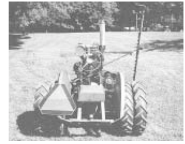
Tractor's low center of gravity and wide stance help when mowing hillsides and ditches.