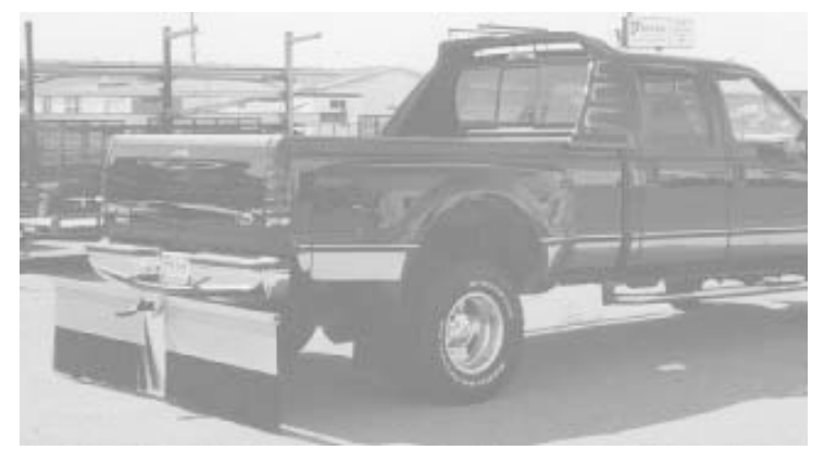
Full-width mud flap fits quickly onto a receiver hitch and locks in place with set screws in less than a minute.