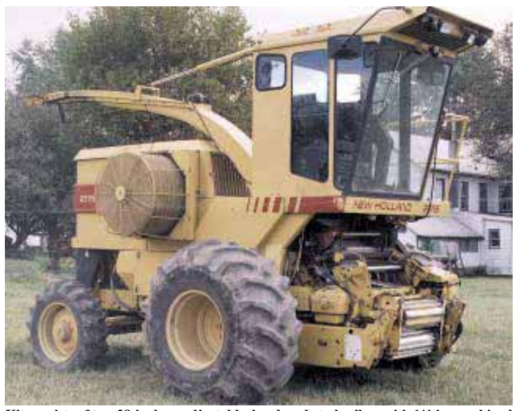
Kit consists of two 28-in. long adjustable, hardened steel rollers with 1/4-in. machined grooves that install under the cab and just above the cutterhead.

Contact: FARM SHOW Followup, David Shupe, 797 Co. Rd. 1100 E., Toledo, Ill. 62468 (ph 217 849-3240).