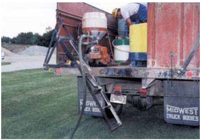
Ladder mounts at right angle to back of truck, making it easy to climb in.