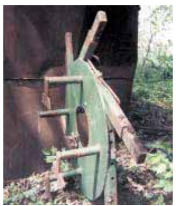
Each spade consists of a length of channel iron with a telescoping length of rectangular tubing inside it. The tubing digs into the ground between the dual wheels.

"They give me traction like you wouldn't believe and make a huge difference whether I'm plowing or harvesting peas or sweet corn," says Willette. "I can mount them between the duals of any tractor or on the outside of single wheels. I can set them to run up to 1 ft. deep so they penetrate the subsoil which is hard and firm, providing the push to go ahead. If I'm in mud and take them off one side of the tractor, the tractor will turn right around in a circle.