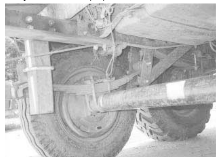
Jones removed pickup's rear bumper and bolted on a pair of 4-in. angle irons which extend the pickup frame by 18 in. A vertical length of 4-in. sq. tubing is U-bolted to each angle iron and also clamped to the back end of each spring on the extra axle.

Contact: FARM SHOW Followup, Lawson Jones, 8243 59th St. N.E., Webster, N. Dak. 58382 (ph 701 395-4437).