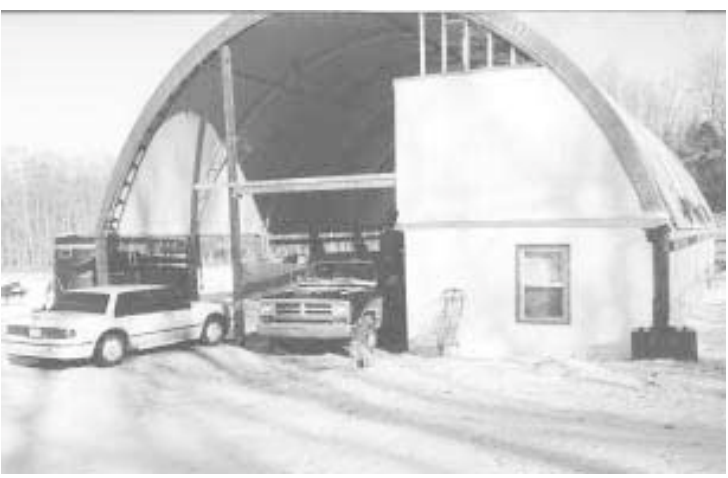
Phil Stipp, his wife and son moved into this 40 by 50-ft. Cover All building last February. They live in a 13-ft. wide area along one side of the building.

To change your address, renew your subscription, take out a new subscription, order videos or books, or for other information regarding your subscription, contact: Circulation Department, FARM SHOW, P.O. Box 1029, Lakeville, Minn. 55044 (ph 1-800-834-9665; fax 612 469-5575) E-Mail: Circulation @farmshow.com.