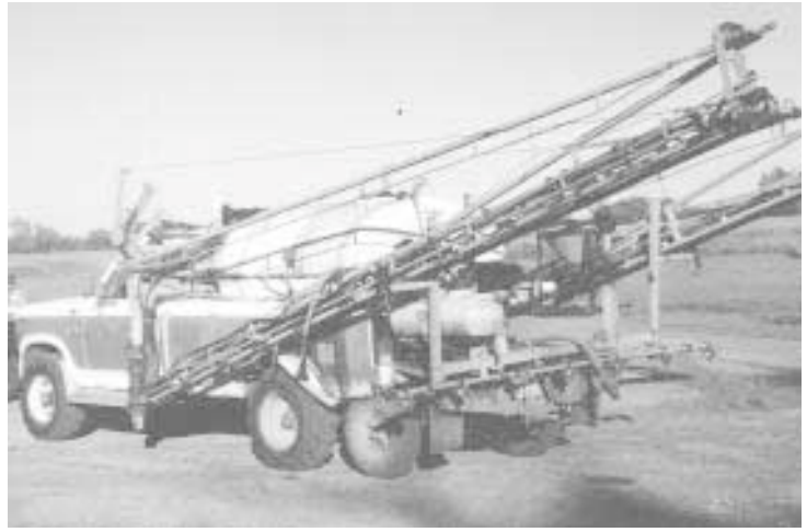
Jones mounted the wheels, axle, and springs off a trailer house on back of his 1985 Ford F-350 1-ton pickup. It's equipped with an 88-ft. spray boom.