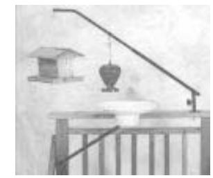
Pole mounts solidly to deck rails for hanging flags, flower pots, bird feeders, etc.

Contact: FARM SHOW Followup, Robert Straub, RJS Specialties, P.O. Box 142, Sauk Centre, Minn. 56378 (ph 888 757-7732; fax 320 352-2126).