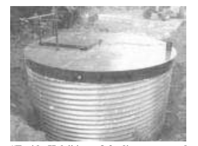
"Fraidy Hole" is an 8-ft. dia. corrugated steel pipe covered by a flat steel plate lid. It'll hold 8 people comfortably.

The unit sells for $1,245 plus S&H. Contact: FARM SHOW Followup, John