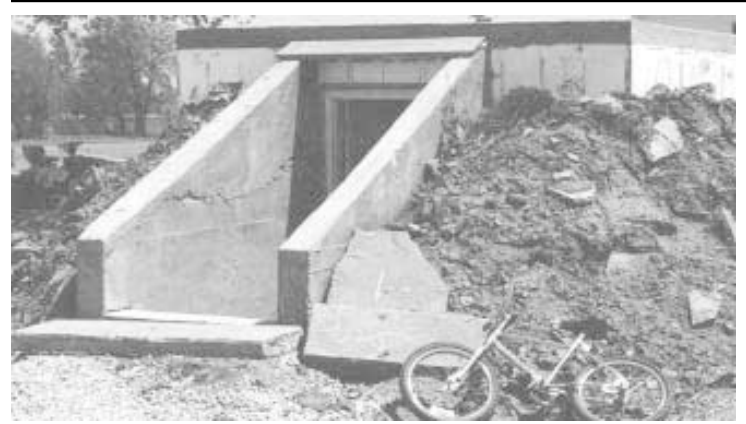
Shelter was built using styrofoam blocks with hollow cores filled with concrete.