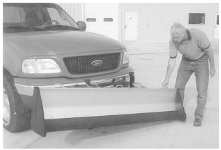
To attach plow, you lift one end of blade at a time over a pair of vertical holders mounted on a push frame. Frame slides into a receiver hitch on front of vehicle.