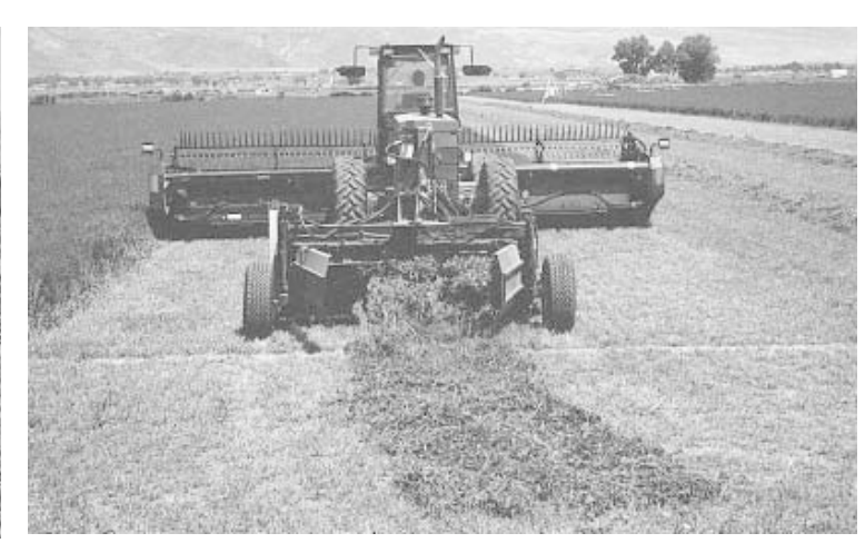
Draper header gives them the option of dropping cut hay in the center or off either end.