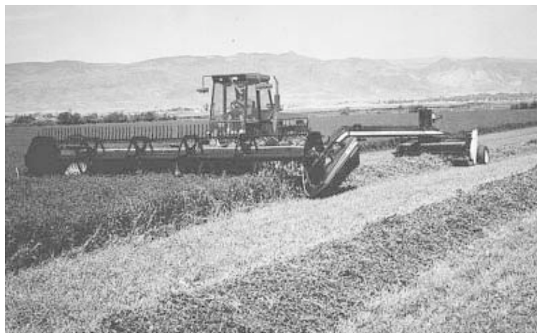
The Tufts mounted a 25-ft. MacDon 972 draper harvest header on front of their Ford Versatile Bi-Directional tractor and a Circle C crusher roller conditioner on back.