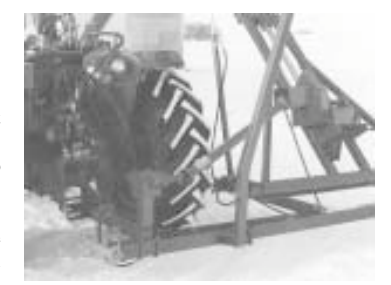
Ailsby's home-built transport frame hitches to side of tractor.

He adds a 2-in. hydraulic cylinder with a 48-in. stroke to raise or lower the bottom end of the auger. "Today's tractors really have more powerful hydraulics than you need for an auger. If you're not careful, you can bend the auger tube when you're raising it up. es-