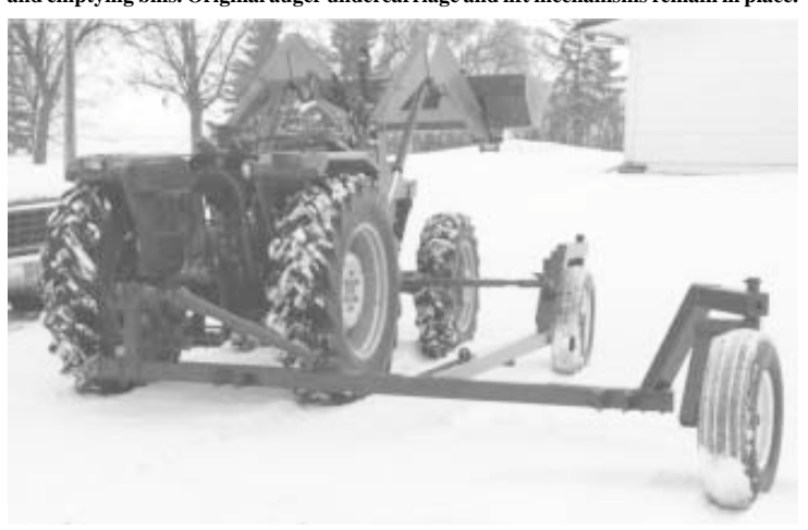
Two pivoting caster wheels allow transport frame to freely follow tractor. "Backing the auger into place is no more difficult now than backing the tractor," says Ailsby.