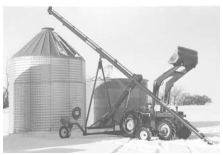
Tractor is positioned midway along auger tube so Ailsby can use auger both for filling and emptying bins. Original auger undercarriage and lift mechanisms remain in place.

Contact: FARM SHOW Followup, Arvin De Cook, 9658 Hwy. F62 E., Sully, Iowa 50251 (ph 641 594-3438).