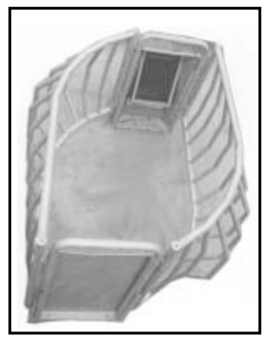
The 5-ft. wide, 7-ft. long crate has specially-designed concave sides, with a door that doubles as a feeder at one end. Oval design allows sow to move more freely and to turn inside the stall.

"Even though the crate is oval-shaped it takes up no more room than a conventional crate," says Reid. "In fact, if you place the back end of the crate against a wall, this crate actually takes up 30 percent less space. By walking inside the crate you can easily reach into the corner and catch the piglets, which you can't do with a conventional crate. Another advantage is that the sow is much more likely to work manure through a slatted floor. Also, she's able to keep the crate cleaner without making a mess at the feeder. If the crate's bottom rail ever rusts out, you can simply turn