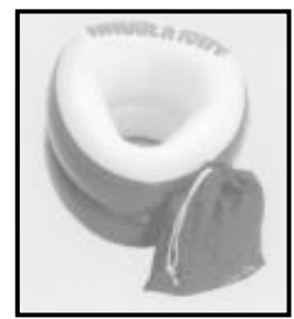
Inflatable toilet uses a plastic bag liner which is removed after every use.

Comes with three disposable liners and twist ties, tissues and an extension tube for