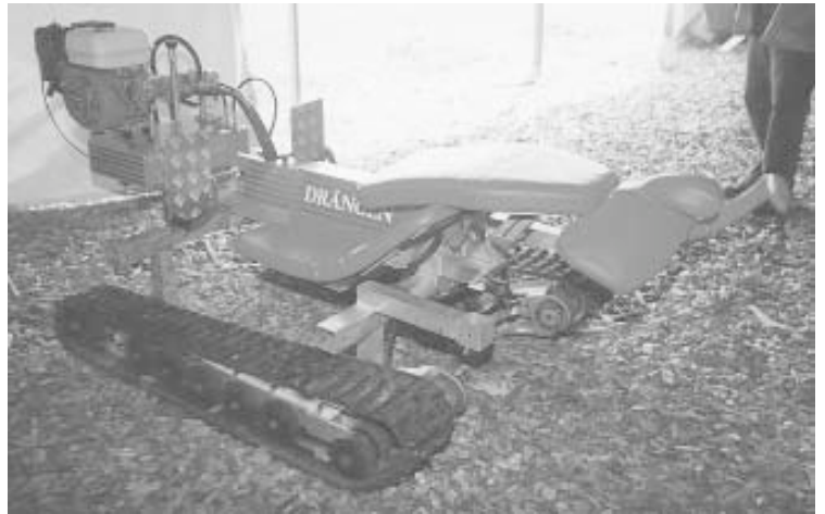
Motorized laydown work cart looks like a massage table mounted on snowmobile treads.

Contact: FARM SHOW Followup, Hitch Things, Inc., 600 East Paper Mill Rd., Chambersburg, Pa. 17201 (ph 877 734-3920 or 717 263-9982; fax 717 263-6916; E-mail: sales@hitchthings.com; Website: www.hitchthings.com).