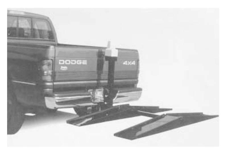
Electric-powered "lift and go" platform mounts on pickup receiver hitch and can be used to haul everything from ATV's to garden tractors and other cargo.