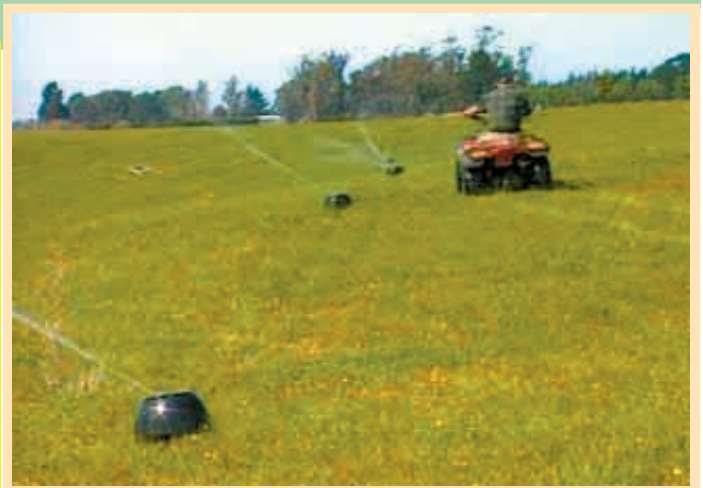
K-Line system consists of a series of tough plastic pods spaced 50 ft. apart and connected by flexible poly pipe. Pods protect sprinklers from livestock.

Contact: FARM SHOW Followup, John D. Nelson, Box 360 Day Hill Rd., Foster, Ky. 41043 (ph 606 747-5894).