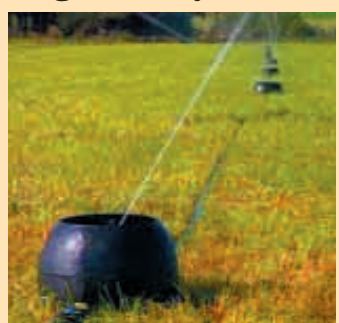
Row of sprinklers can be easily towed from field to field behind ATV or tractor.

"It uses water more efficiently than anything on the market and can be used anywhere, without a lot of labor and expensive equipment," says Trott. "The system requires a minimum of only 35 lbs. of pressure and therefore works great for low flow application which greatly reduces run-off. As a result, you can leave the system in place without having to move it several times a day.