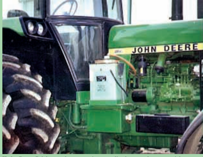
Hydro Power Pak lets you burn water in gas or diesel-powered tractors, pickups, semi trucks and other vehicles.

Pricing for the highway tractor market will