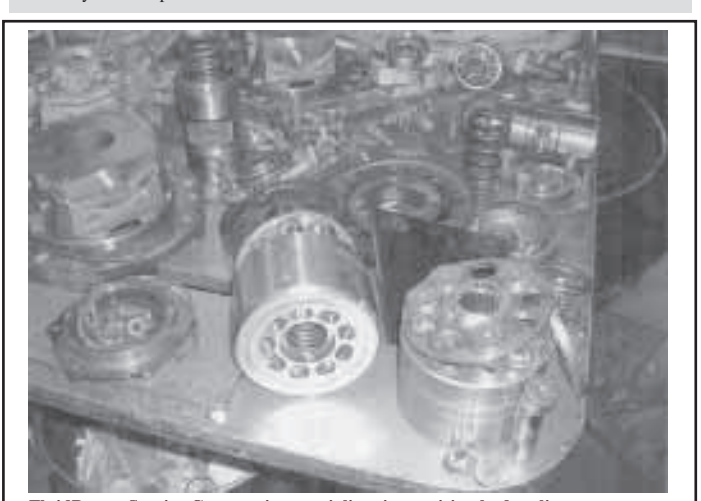
FluidPower Service Corporation specializes in repairing hydraulic pumps.

Contact: FARM SHOW Followup, James Weaver, Weaver 's Repair, 9507 Forest Ridge Road, Shippensburg, Pa. 17257 (ph 717 477-9332).