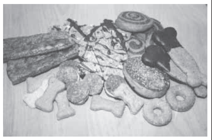
Chris and Audra Bell use human-grade ingredients to make healthy doggy treats.

Audra says they display all information that helps make them unique in the marketplace. All products have a list of ingredients and a complete nutritional breakdown. They also