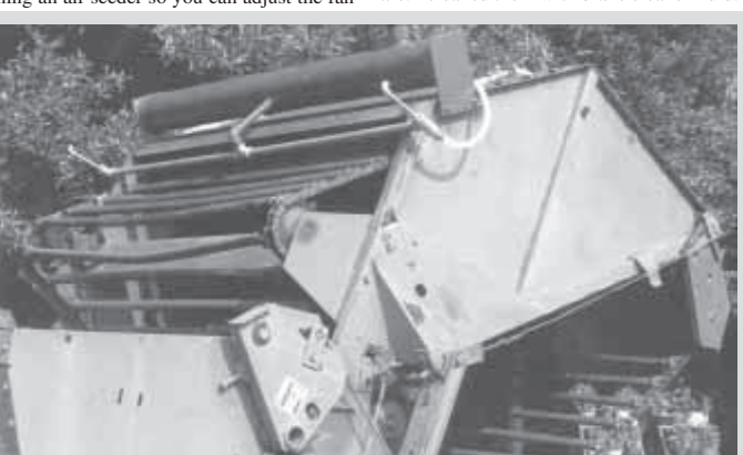
Bolted onto baler endgate, reservoir automatically applies a steady stream of oil to chains every time endgate is raised.

Albert L. Url, 4117 E. Briges Road, Elk, Wash. 99009: "It discovered an easy and inexpensive way to test radiators for leaks. I put a shop vac on the blow cycle and blow into the radiator to find out where the leaks are. I cleaned them with brake cleaner fluid.