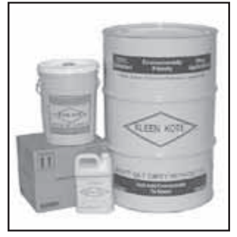
Kleen Kote shines up painted surfaces. It also cleans out and fills surface cracks.

pecially valuable when used on farm equipment. Fertilizer, chemical and manure spreaders/applicators are especially subject to corrosion. He says a layer of Kleen Kote will cut corrosion in half.