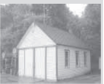
One-room school house is now a farm shop.

He made the 6-ft. long platform out of 1in. sq. tubing with 10-in. legs in each corner and a drive-on ramp at an end. Plywood run-