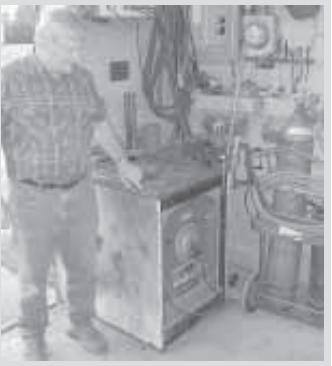
Old clothes washer cabinet houses Flohaug's arc welder.