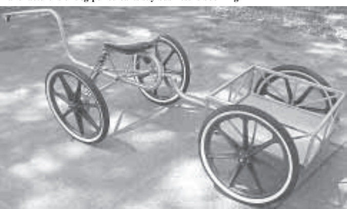
Cart's dorsal hitch extends up and over back of animal to a point just behind the front shoulders, where it attaches to harness.