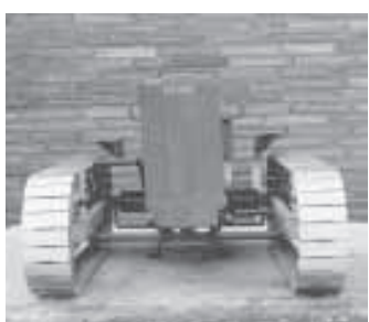
To make the track, Miller mounted no. 40 roller chain around both sets of sprockets, then welded a series of flat steel cleats onto the chain. One cleat is welded onto each chain link.

To make the track, Miller mounted no. 40 roller chain around both sets of sprockets, then welded a series of flat steel cleats onto the chain. The cleats measure 1 in. wide by 4 in. long and are 1/8 in. thick. One cleat is