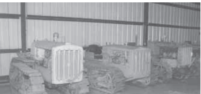
About 20 of the old tractors are in running condition, with 12 completely restored.