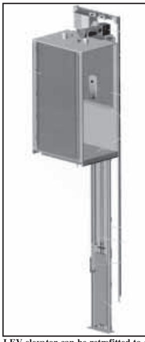
LEV elevator can be retrofitted to existing homes or installed in new construction.

Contact: FARM SHOW Followup, Access Industries, 4001 East 138<sup>th</sup> St., Grandview, Mo. 64030 (ph 800 925-3100; fax 816 763-4467; website: www.accessind.com).