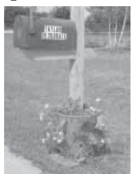
Flower pot is made of two halves that clamp together around the base of mailbox or any 4 by 4 post.

Contact: FARM SHOW Followup, Taylor Deckorate, P.O. Box 178, Roscoe, Ill. 61073-0178 (ph 866 393-7322 or 815 623-8828; fax 815 623-8988; website: www.taylordeckorate).