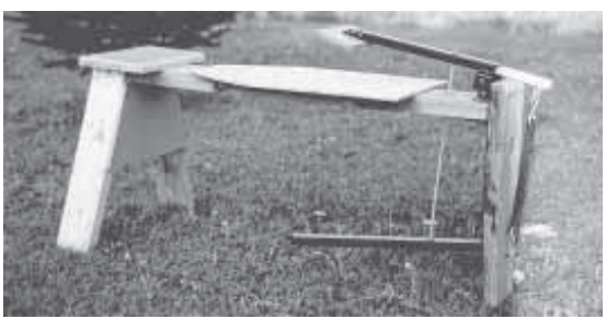
Foot-operated lever applies downward pressure to hold fish in place.