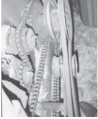
Photo at left shows normal belt operation. When baling short straw, Storch moves belt to add-on pulley and idler, right.