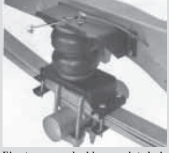
Firestone uses double-convoluted air springs for increased load-leveling and carrying capacities.

Air Lift helper springs add up to 2,000 lbs.