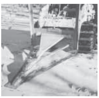
Saw has sharp-toothed edges that slice through trees up to 8 in. in diameter.

Besides price, another noticeable difference in Bolinger's tree saw is the horizontal 1/2-in. steel blade mounted to the point of the V-shaped saw. It allows him to dig in