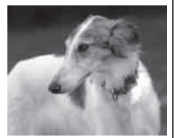
Silken Windhound breed was developed by breeding Whippet-type dogs to Borzois.

Contact: FARM SHOW Followup, The International Silken Windhound Society, R. Lynn Shell, 2613 County Road 330.