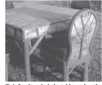
Twig furniture includes tables such as the

According to Gary, birch cuts best if the temperature is above 32°. Willows can be cut in temperatures down to zero or colder and