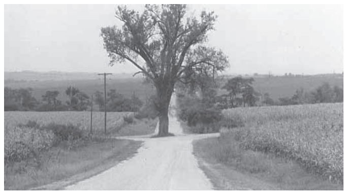
A tree standing alone in a field is a novel enough sight. But in Iowa there's a tree that stands in the middle of a gravel crossroads. You can't miss it.