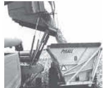
Side dump wagon has a capacity of four tons. It takes less than one minute to dump the wagon and bring it back down.

He says they built their first cob collector 12 years ago and have made several improvements since then. They've sold wagons as far away as Canada. They also do custom har-