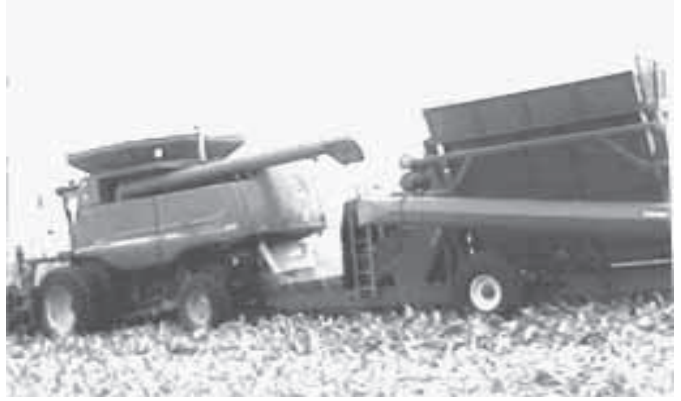
Vernon Flamme's cob collector uses a conveyor to deliver cobs into trailing side dump wagon. System is powered by a diesel engine that direct-drives a hydraulic pump.