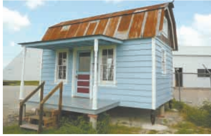
"They're really cute and small, yet functional," says Brad Kittel about his Tiny Texas Houses. They're built from salvaged vintage lumber and other materials.

cycled, they are built to code with new wiring, plumbing and insulation. They are also completely portable, so that the owner can also move the building at a later time if they