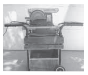
table power sanding machine. First I removed the grill from the stand and replaced it with some wooden boards. Then I mounted a beltdisc sander onto it (any other light shop tools could also be used). I also closed the ends and the back side of the frame with plywood to give the frame more strength, then built a shelf into it to store extra discs or belts. Now I can easily move my sanding machine wherever I need it. It works great.

Corneil Hiebert, Altona, Manitoba: "I converted an old barbeque grill into this por-