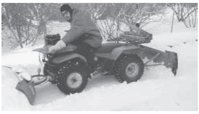
Simple hand-powered levers raise and lower snow blades.

Both blades are a few inches wider than the ATV on each side, and they can be mounted or taken off in less than five minutes with no tools, according to