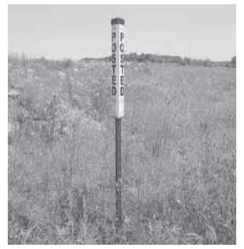
Three-sided metal signs fit over metal posts and come with large blaze orange letters that can be seen from a long distance.

Cost for each sign is $10.95 for a 24-in. and $14.95 for a 60-in., plus shipping. Besides POSTED written vertically, the signs have labels that say No Trespassing, No Hunting or Hunting by Permission Only.