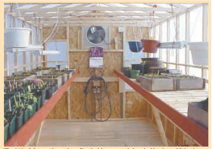
The 16 by 8-ft. greenhouse is outfitted with water and electrical hookups. Makes it easy for him to start hundreds of plants.