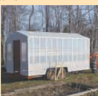
He cut a hole for a fan at one end and a doorway at the other end.

The interior of the trailer consists of two