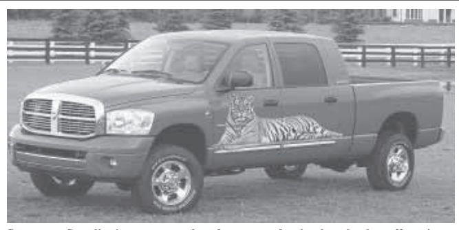
Sanctuary Supplies is a one-stop shop for zoos and animal parks that offers signs, toys, equipment and other services such as advertising and web page design.

Contact: FARM SHOW Followup, Sanctuary Supplies, 4300 Pletzer Boulevard, Rootstown, Ohio 44272 (ph 877 886-1992; Wesley@sanctuarysupplies.com; www.sanctuarysupplies.com).