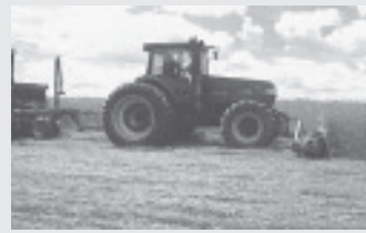
Photo shows roller knocking down a 4-ft. tall cover crop with a Deere no-till drill hooked on behind.

According to company literature, the goal of the Cover Crop Roller is not to cut the