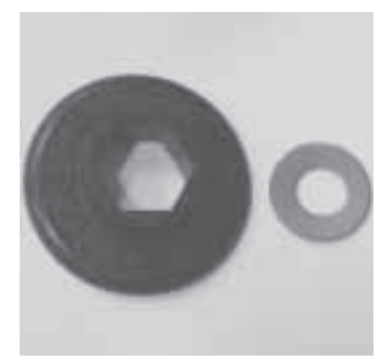
Concord bearing sealer is designed to protect the seal and bearings on the closing wheels on Deere 750 and 1850 No-Till grain drills.

Concord Equipment is in the process of finding distributors to handle the product. In the meantime, they're selling them direct. From one to 15 bearings, the unit price is