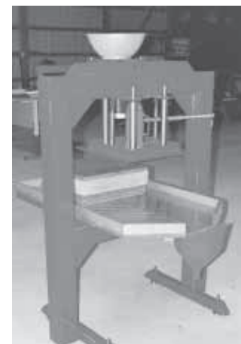
Shephard combined steel, plywood and a hydraulic pump to make a cider press.