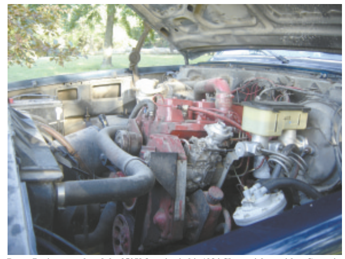
Bruce Basinger replaced the 350 V-8 engine in his 1984 Chevy pickup with a Cummins 4-cyl. engine.

Best of all, he adds, are the conversations