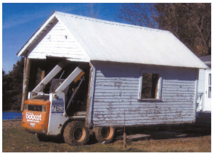
Skid loader had no trouble moving outbuilding in one piece.

bal Neighbor, Inc., 2000 Composite Dr., Dayton, Ohio 45420 (ph 937 285-0990; support @g-neighbor.com; www.NatureZap.com).