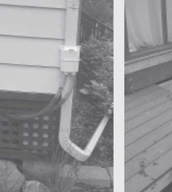
Second Rain water "barrels" are designed to be concealed under patio seating in plant