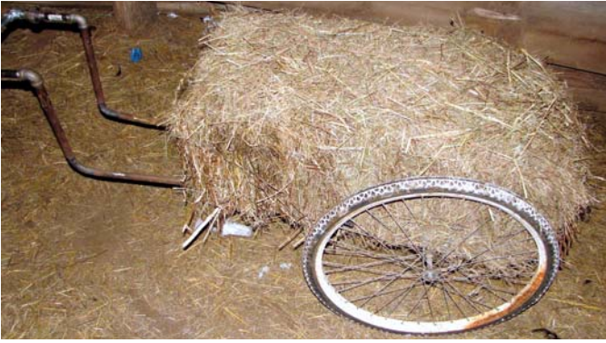
Bale cart rides on bicycle wheels, making it roll almost effortlessly, says Mommens.