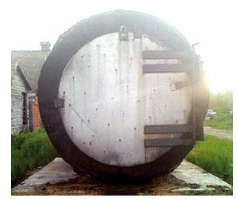
Lewis Stickney bales hard fescue straw and burns it in his homemade burner.

"We feel that approximately 2/3 of the heat generated is from the smoke and only 1/3 from the initial burn," Stickney says. To capture that extra heat generated before it passed out the chimney, Stickney made a heat exchanger out of pipes that passes through the water jacket in the 10-ft. space behind the combustion chamber. The flue gas passing through these pipes accounts for the majority of heat captured.