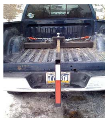
New device lets you use a 5th wheel hitch without having to modify your pickup bed.

Steel tube equipped with a 2 5/16-in. ball fits between the wheel wells. J-shaped steel tube runs back to pickup's receiver hitch.