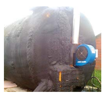
Burner was built out of 2 large underground fuel tanks.

"One other problem was that when we were doing a burn, we were producing heat so fast that, even though the water jacket held about 6,000 gal., it would soon start to boil. We installed a swimming pool pump ($100 on eBay) to circulate the water when the burner blower is on."