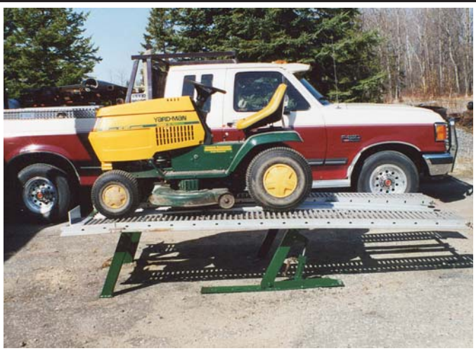
Once the riding mower reaches a tipping point, deck tilts back to a horizontal position.