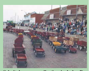
Schultz's wagon collection includes Radio Flyers, Greyhound, Arrow, Mercury, Deere and other models.

Contact: FARM SHOW Followup, Dwain Schultz, 201 Pearl St., Clarks, Neb. 68628 (ph 308 548-2238).