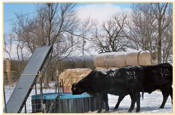
A 4 by 8-ft. solar panel sets outside tank, with a small pump circulating antifreeze from panel to a copper heating coil inside pvc drinking tube.