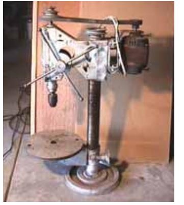
Forrest Spindler's father made this drill press more than 60 years ago, largely out of car parts. It still works great.

place. Exactly how the spindle is constructed is a mystery to Spindler, as it is encased in the drill head housing and he has never taken it apart.