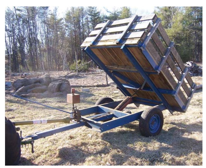
Steve Siter uses the pto-powered hydraulic pump off a 1937 dump truck to raise and lower his home-built dump trailer.